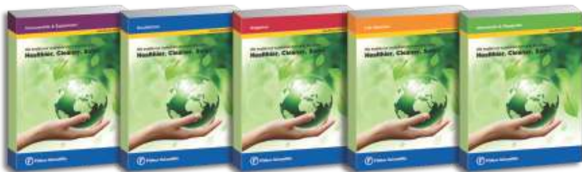
Consumables & Equipment